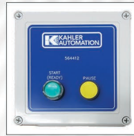
Start Pause Ready Activate or pause loading