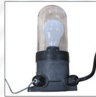
Purge Light Notifies operator when line is being purged