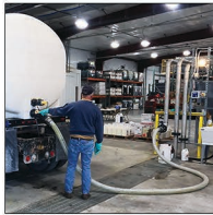
Truck Present Sensor Helps confirm truck is in proper position

Provide drivers with complete bay controls for an easy loadout process.