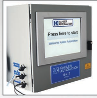
Basic Indoor TSA Easy touch screen access panel for indoor use, with heater

Offers drivers easy loadout operation from panel offerings that fit your application.