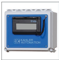
Signature Pad Connects via ethernet cable (indoor use only)

For streamlined documentation connect a signature pad or printer to the TSA.