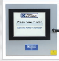
Standard Indoor TSA Easy touch screen access for indoor use, with heater and A/C unit