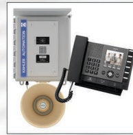
Master Intercom Station Connects with up to 25 remote camera intercoms