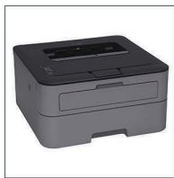
Laser Printer For printing receipts indoors