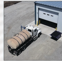
Door/Gate Opening System Available as either single-bay or double-bay system