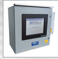
Standard Outdoor TSA Easy touch screen access panel for outdoor use, with heater, A/C, drip cap & sunlight-readable screen