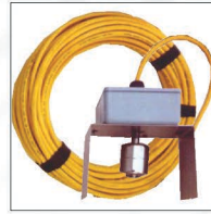
Sump Sensor Used for overflow/spill detections