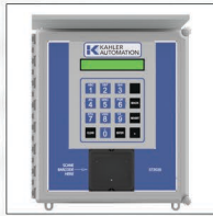
Standard KA2025 Keypad & barcode scanner entry unit for scale pre-staging and door/gate control