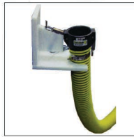
Equipment Sensors Confirm hose & ladder are stored after loading