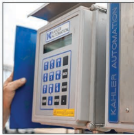
Basic KA2025 Keypad entry unit for scale pre-staging and door/gate control

Ensure that only authorized users have facility access and are able to load-out product.