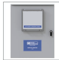
Thermal Printer For printing receipts outdoors