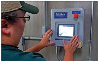
The remote touchscreen provides the ability to run the system manually if needed.