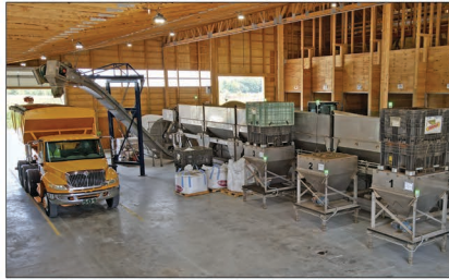
System controls 6 main products, 3 micros, and respective liquids for optimum agronomic blends.