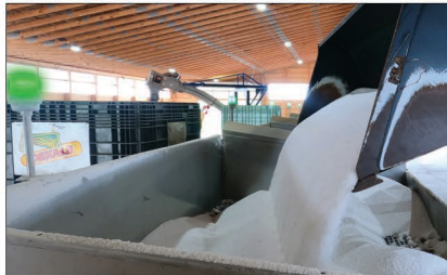
Indicator lights signal the loader operator to when product can be added.