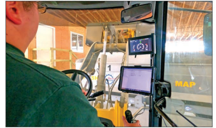
One person can load out & operate reclaim from tablet controls in the loader.