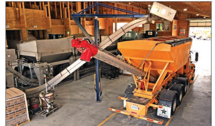
Direct-to-truck legal-for-trade loading without a truck scale streamlines operations